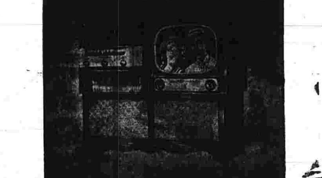
MODEL 37K85: 17" Radio-Phone, Combination $379.95