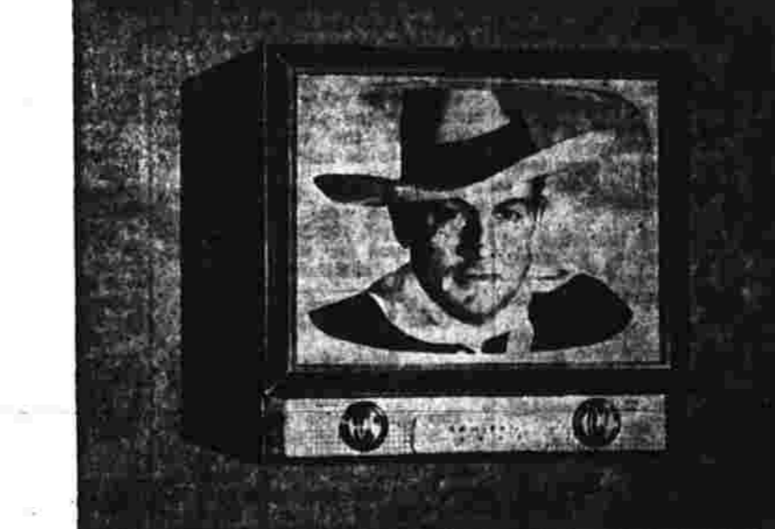
MODEL 17K22: 17 inch Table Model $199.95 MODEL 121K15: 20 inch Table Model $279.95

WNHC-TV carries the top programs of all four television networks. Don't miss this wonderful entertainment another day!