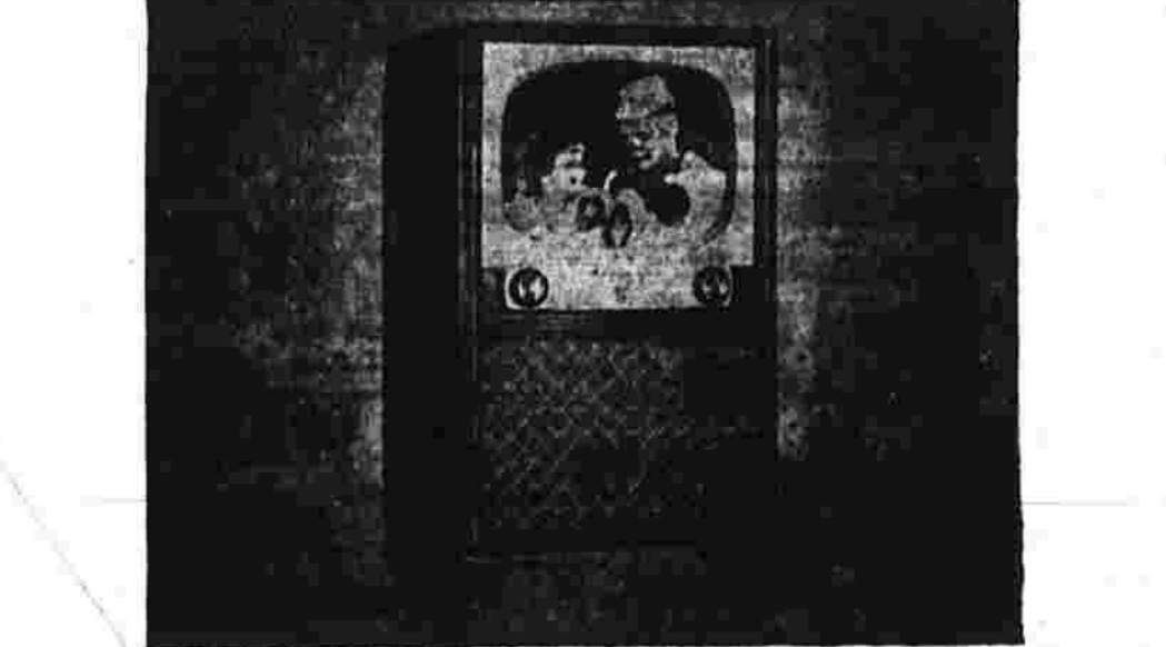
MODEL 27K85: 17 inch Console $259.95