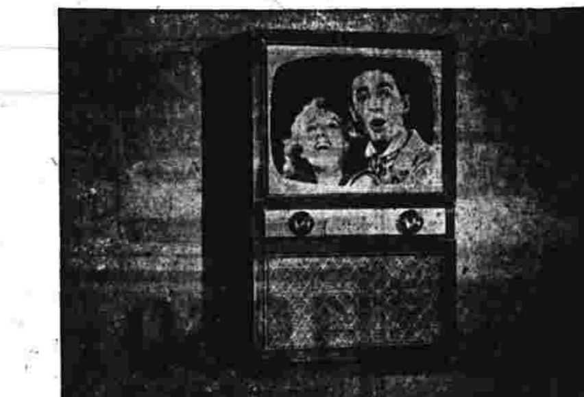
MODEL 221K45: 20 inch Console $329.95